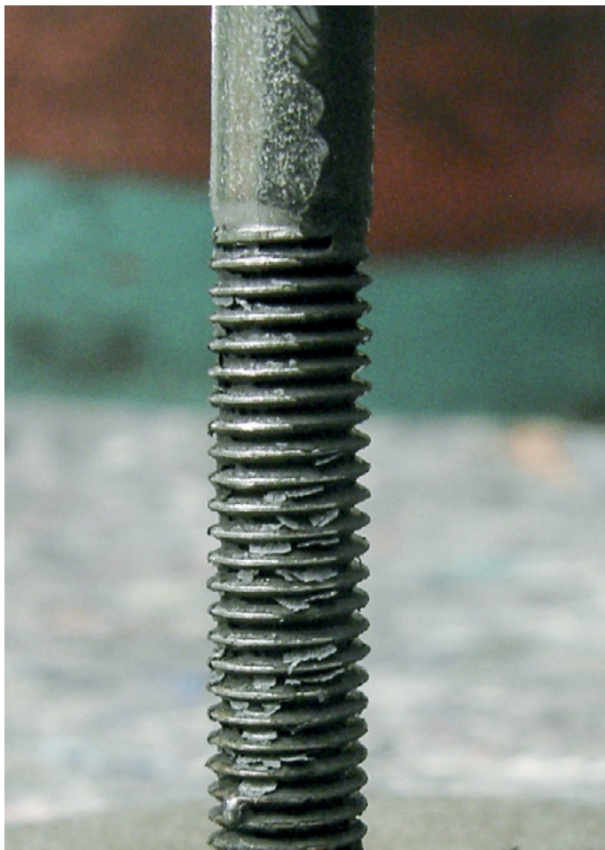
Before: The thread has become heavily soiled with production residue.