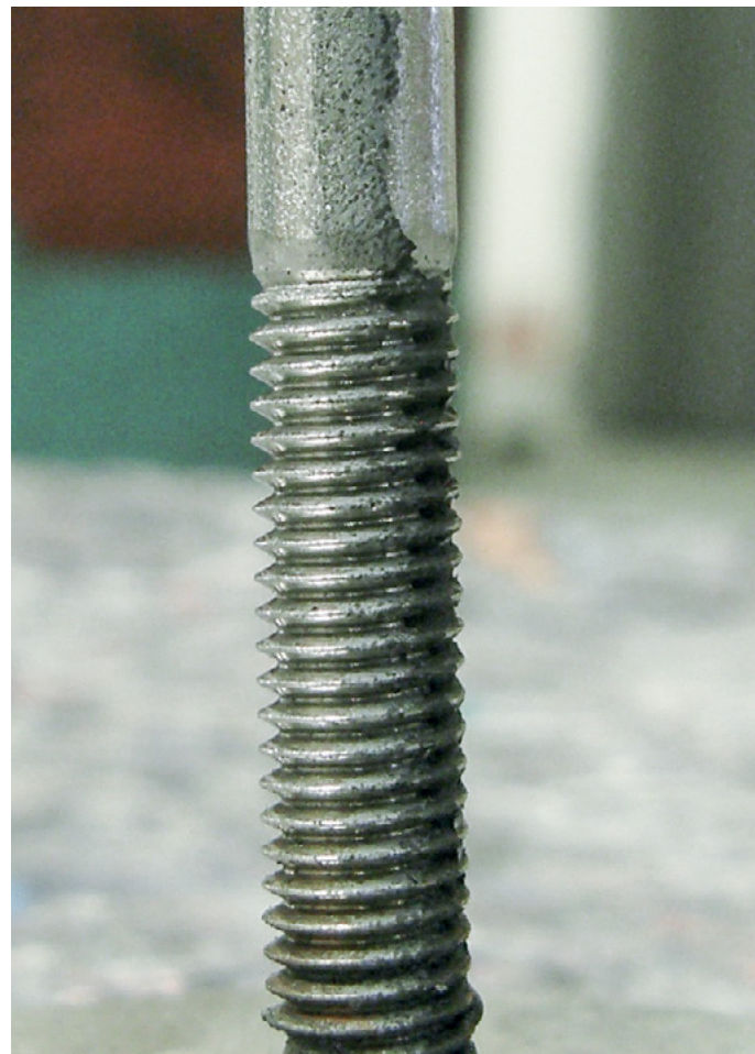
After: Uneven surfaces can be cleaned quickly and easily too, just like that.